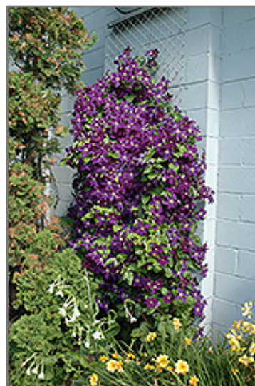
Jackmanii Superba Clematis in bloom