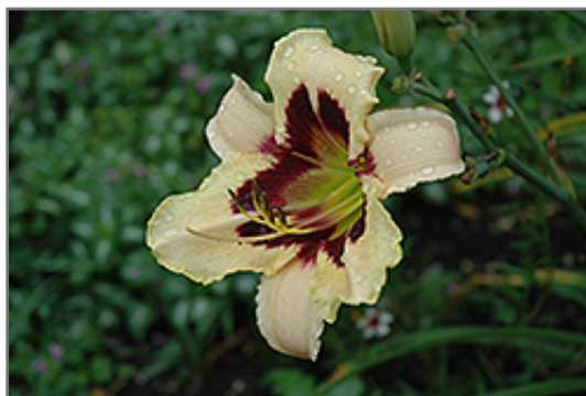
Moonlit Masquerade Daylily flowers