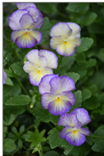
Etain Pansy flowers