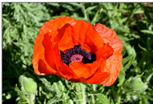
Orange Scarlet Poppy flowers