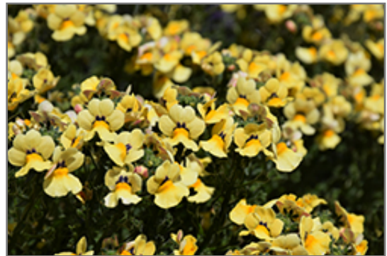
Nesia Inca Nemesia flowers