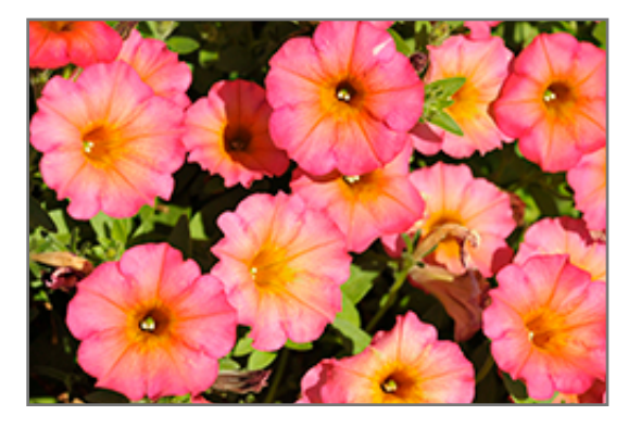
Crazytunia Mayan Sunset Petunia flowers

Crazytunia Mayan Sunset Petunia is recommended for the following landscape applications;