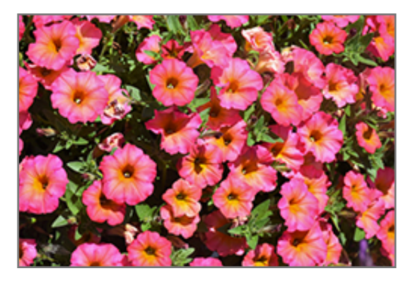
Crazytunia Mayan Sunset Petunia flowers