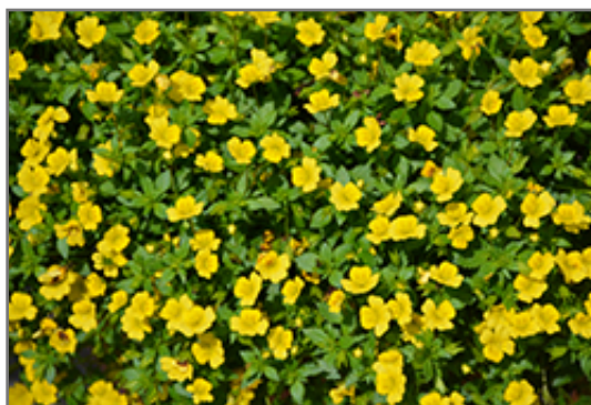
Garden Freckles Mecardonia flowers