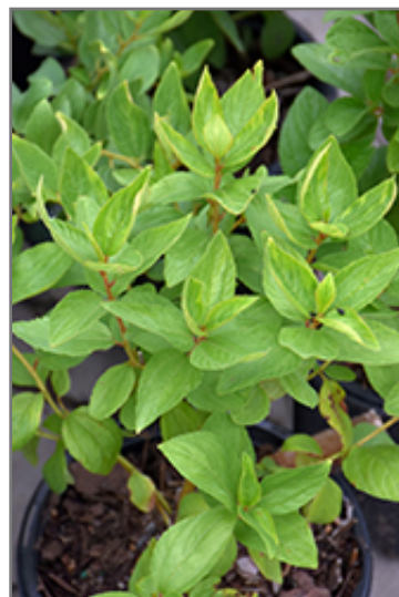
New Jersey Tea foliage

New Jersey Tea is recommended for the following landscape applications;