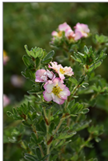
Happy Face Hearts Potentilla flowers