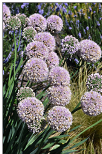
Bubble Bath Ornamental Onion flowers