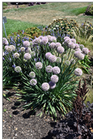
Bubble Bath Ornamental Onion in bloom

Bubble Bath Ornamental Onion is recommended for the following landscape applications;