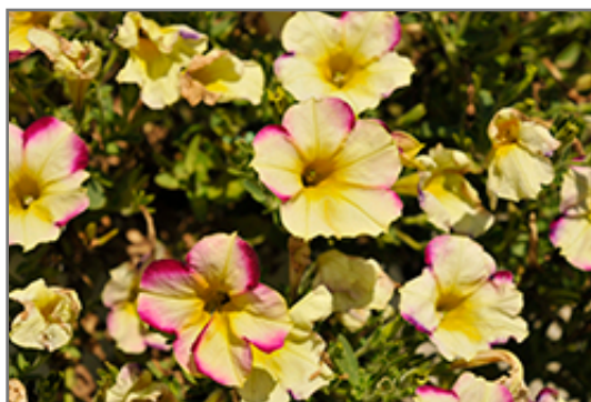
Headliner Banana Cherry Petunia flowers