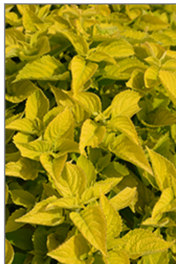
Chartres Street Coleus foliage

Chartres Street Coleus is recommended for the following landscape applications;