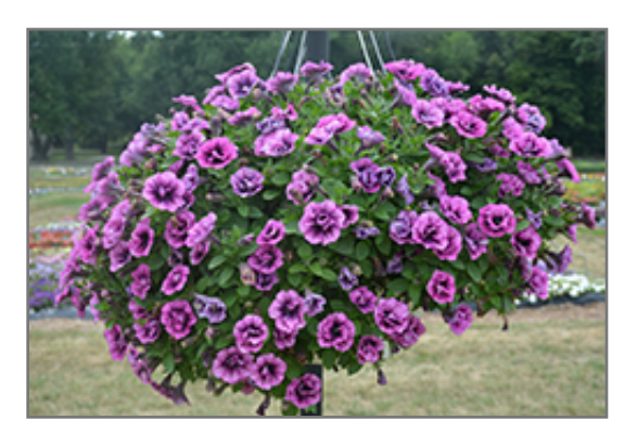
Veranda Compact Double Sugar Plum Petunia in bloom