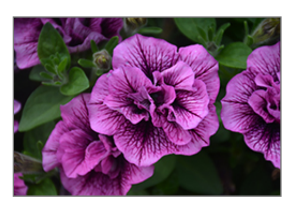
Veranda Compact Double Sugar Plum Petunia flowers

Veranda Compact Double Sugar Plum Petunia is recommended for the following landscape applications;