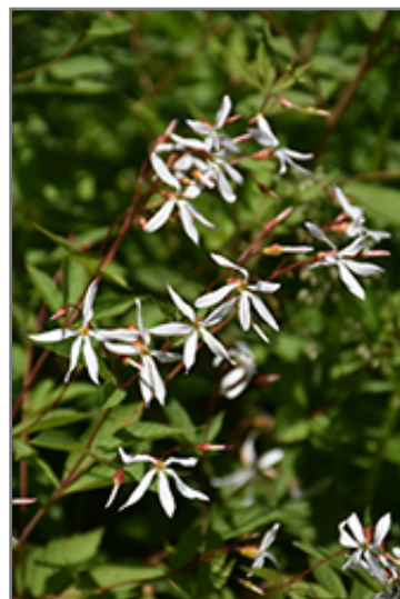
Bowman's Root flowers

This plant will require occasional maintenance and upkeep, and should be cut back in late fall in preparation for winter. It is a good choice for attracting bees and butterflies to your yard. It has no significant negative characteristics.