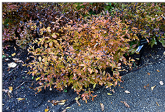
Bowman's Root in fall