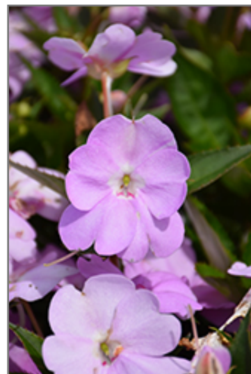
SunPatiens Vigorous Orchid Impatiens flowers

This plant will require occasional maintenance and upkeep, and should not require much pruning, except when necessary, such as to remove dieback. It has no significant negative characteristics.