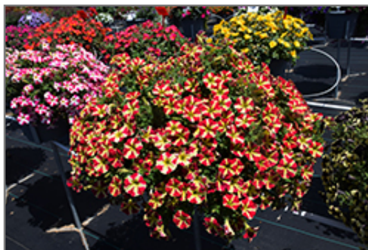
Amore Queen of Hearts Petunia in bloom

Amore Queen of Hearts Petunia will grow to be about 12 inches tall at maturity, with a spread of 14 inches. When grown in masses or used as a bedding plant, individual plants should be spaced approximately 10 inches apart. Its foliage tends to remain dense right to the ground, not requiring facer plants in front. This fast-growing annual will normally live for one full growing season, needing replacement the following year.