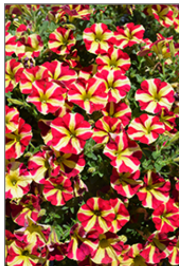
Amore Queen of Hearts Petunia flowers

This plant will require occasional maintenance and upkeep. Trim off the flower heads after they fade and die to encourage more blooms late into the season. It is a good choice for attracting butterflies and hummingbirds to your yard, but is not particularly attractive to deer who tend to leave it alone in favor of tastier treats. It has no significant negative characteristics.