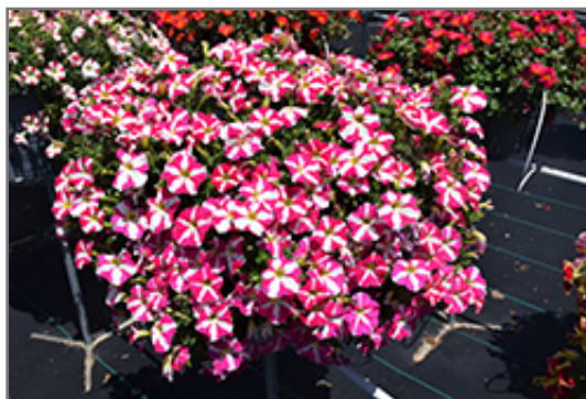
Amore Pink Heart Petunia in bloom

Amore Pink Heart Petunia will grow to be about 12 inches tall at maturity, with a spread of 14 inches. When grown in masses or used as a bedding plant, individual plants should be spaced approximately 10 inches apart. Its foliage tends to remain dense right to the ground, not requiring facer plants in front. This fast-growing annual will normally live for one full growing season, needing replacement the following year.