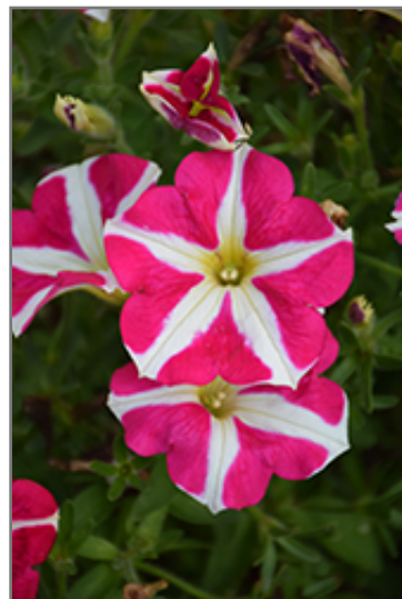
Amore Pink Heart Petunia flowers