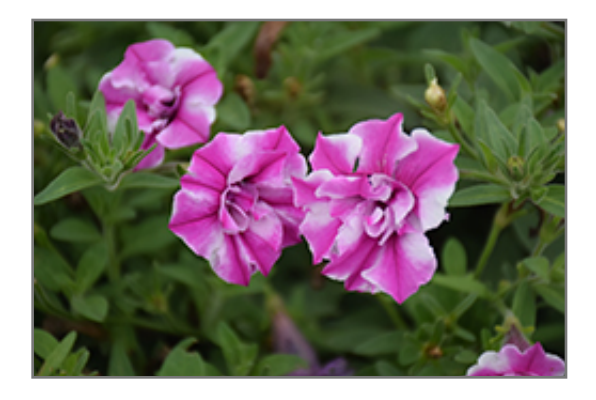
Supertunia Sharon Double Petunia flowers