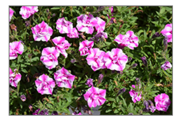
Supertunia Sharon Double Petunia flowers

Supertunia Sharon Double Petunia is recommended for the following landscape applications;