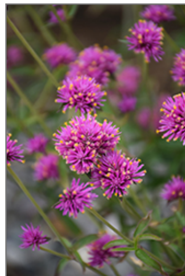
Truffula Pink Gomphrena flowers

This plant will require occasional maintenance and upkeep. Trim off the flower heads after they fade and die to encourage more blooms late into the season. It is a good choice for attracting bees and butterflies to your yard. It has no significant negative characteristics.