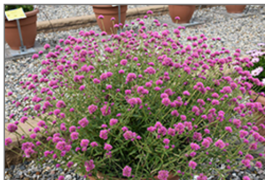
Truffula Pink Gomphrena in bloom