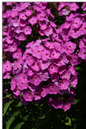
Garden Girls Cover Girl Garden Phlox flowers

Garden Girls Cover Girl Garden Phlox is recommended for the following landscape applications;