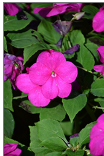
Beacon Violet Shades Impatiens flowers