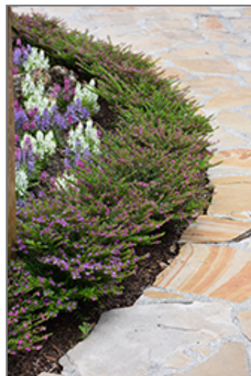
FloriGlory Diana Mexican Heather flowers

FloriGlory Diana Mexican Heather is recommended for the following landscape applications;