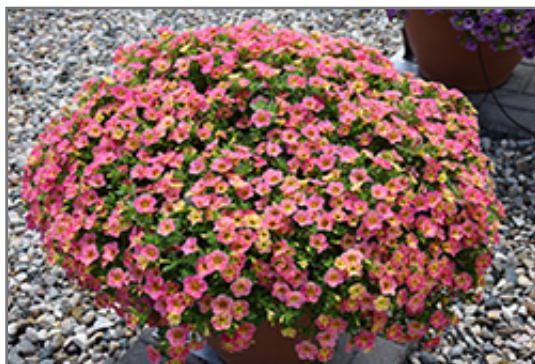
Chameleon Sunshine Berry Calibrachoa in bloom

Chameleon Sunshine Berry Calibrachoa is a fine choice for the garden, but it is also a good selection for planting in outdoor containers and hanging baskets. Because of its trailing habit of growth, it is ideally suited for use as a 'spiller' in the 'spiller-thriller-filler' container combination; plant it near the edges where it can spill gracefully over the pot. Note that when growing plants in outdoor containers and baskets, they may require more frequent waterings than they would in the yard or garden.