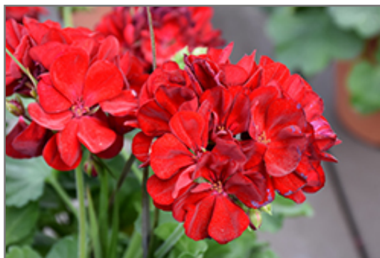
Calliope Medium Dark Red Geranium flowers