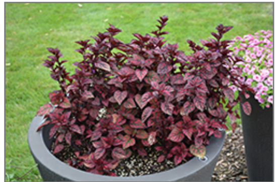
Hippo Red Polka Dot Plant