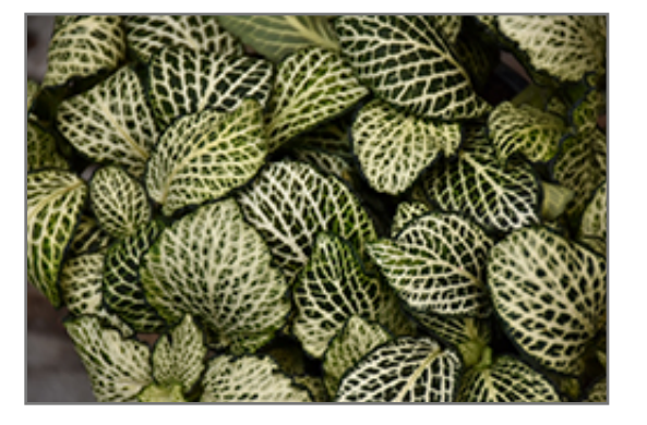
Mosaic Plant foliage

Mosaic Plant's attractive oval leaves remain dark green in color with distinctive white veins and tinges of pink throughout the year on a plant with a spreading habit of growth. It features dainty spikes of white flowers with light green bracts rising above the foliage from mid to early winter.