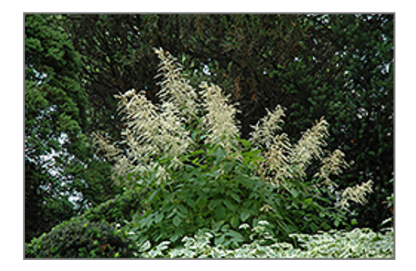
Goatsbeard in bloom