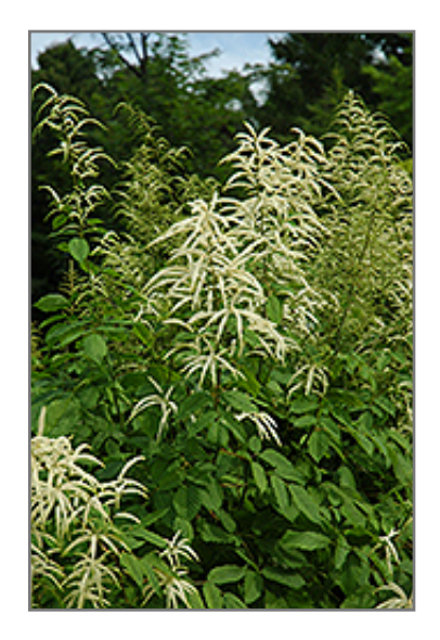
Goatsbeard flowers