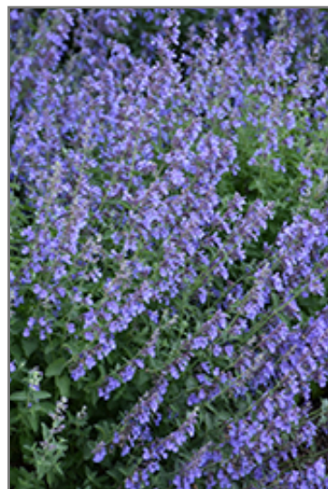
Cat's Meow Catmint flowers

Cat's Meow Catmint is recommended for the following landscape applications;