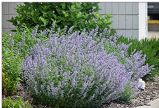
Cat's Meow Catmint in bloom