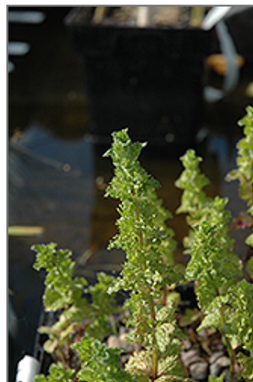
Curly Mint foliage

Aside from its primary use as an edible, Curly Mint is suitable for the following landscape applications;