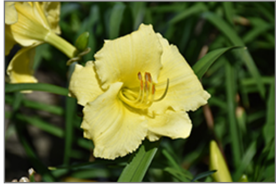
Fragrant Returns Daylily flowers