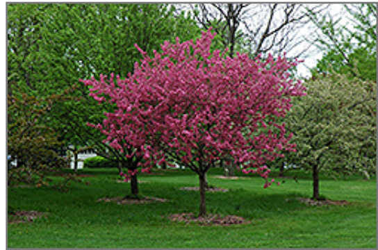
Prairifire Flowering Crab in bloom

This tree will require occasional maintenance and upkeep, and is best pruned in late winter once the threat of extreme cold has passed. It is a good choice for attracting birds and bees to your yard. It has no significant negative characteristics.