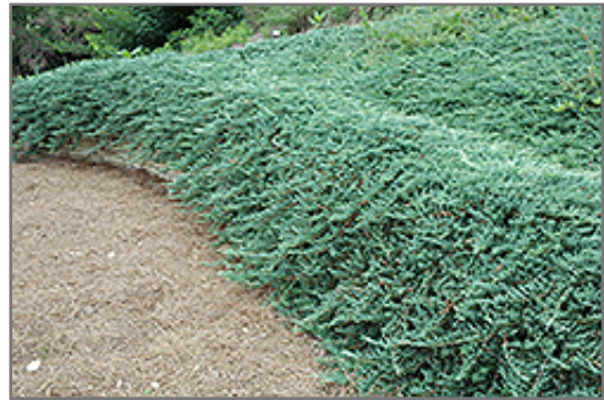
Bar Harbor Juniper