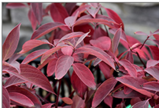
Arctic Fire Red Twig Dogwood in fall

This shrub does best in full sun to partial shade. It is an amazingly adaptable plant, tolerating both dry conditions and even some standing water. It is not particular as to soil type or pH. It is highly tolerant of urban pollution and will even thrive in inner city environments. This is a selection of a native North American species.