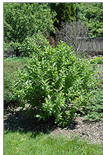
Arctic Fire Red Twig Dogwood