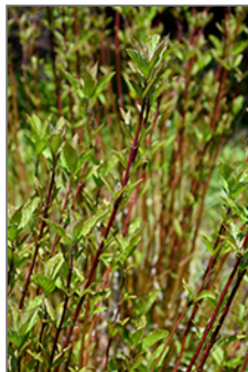
Arctic Fire Red Twig Dogwood stems

Arctic Fire Red Twig Dogwood is recommended for the following landscape applications;