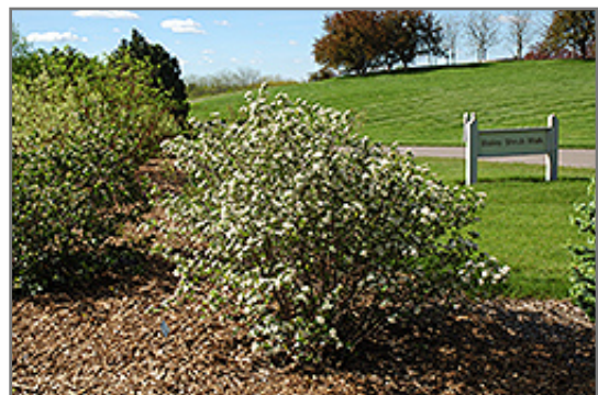
Autumn Magic Black Chokeberry in bloom