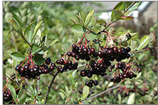
Autumn Magic Black Chokeberry fruit

This shrub should only be grown in full sunlight. It is an amazingly adaptable plant, tolerating both dry conditions and even some standing water. It is not particular as to soil type or pH, and is able to handle environmental salt. It is somewhat tolerant of urban pollution. This is a selection of a native North American species.