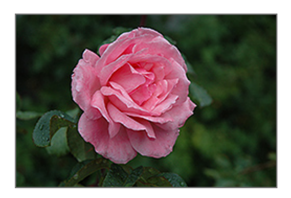
Queen Elizabeth Rose flowers

Queen Elizabeth Rose is recommended for the following landscape applications;