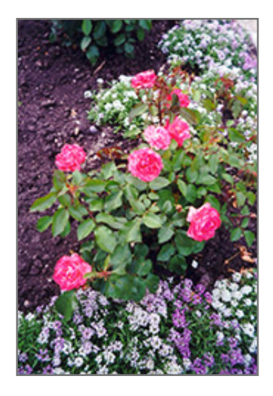
Queen Elizabeth Rose in bloom