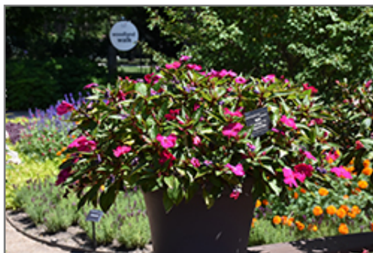
Solarscape Magenta Bliss Impatiens in bloom

Solarscape Magenta Bliss Impatiens will grow to be about 9 inches tall at maturity, with a spread of 20 inches. When grown in masses or used as a bedding plant, individual plants should be spaced approximately 14 inches apart. Its foliage tends to remain low and dense right to the ground. This fast-growing annual will normally live for one full growing season, needing replacement the following year.