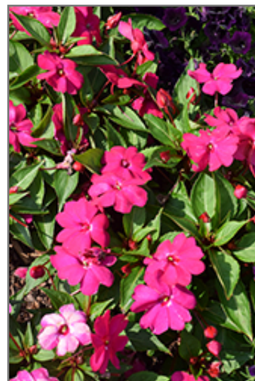
Solarscape Magenta Bliss Impatiens flowers

Solarscape Magenta Bliss Impatiens is recommended for the following landscape applications;