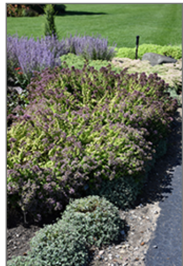
Drops of Jupiter Oregano in bloom