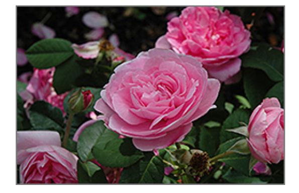
Gertrude Jekyll Rose flowers