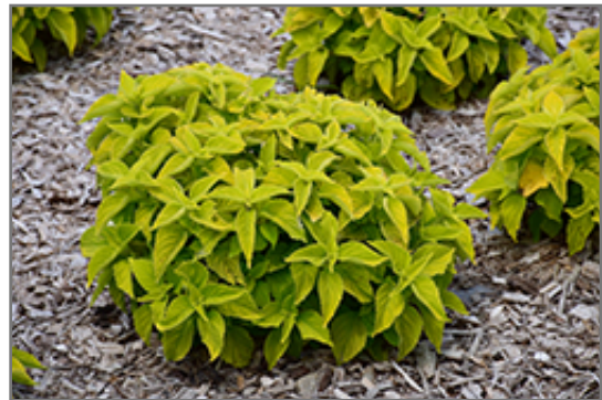
Chartres Street Coleus