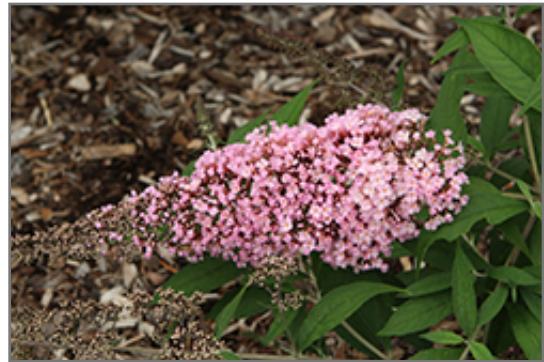
Pink Cascade II Butterfly Bush flowers

Pink Cascade II Butterfly Bush is an open multi-stemmed deciduous shrub with a shapely form and gracefully arching branches. Its average texture blends into the landscape, but can be balanced by one or two finer or coarser trees or shrubs for an effective composition.