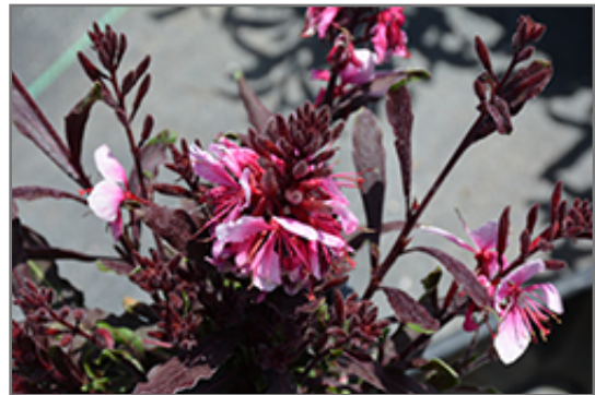
Bantam Pink Gaura flowers