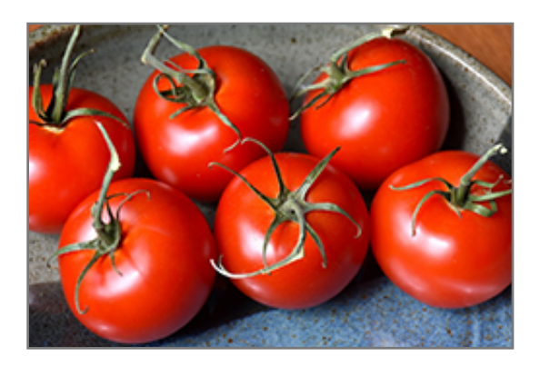
Patio Tomato fruit

Patio Tomato will grow to be about 24 inches tall at maturity, with a spread of 24 inches. When planted in rows, individual plants should be spaced approximately 24 inches apart. Because of its vigorous growth habit, it may require staking or supplemental support. This fast-growing vegetable plant is an annual, which means that it will grow for one season in your garden and then die after producing a crop.