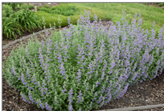
Walker's Low Catmint in bloom