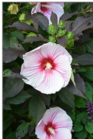
Dark Mystery Hibiscus flowers

Dark Mystery Hibiscus is recommended for the following landscape applications;