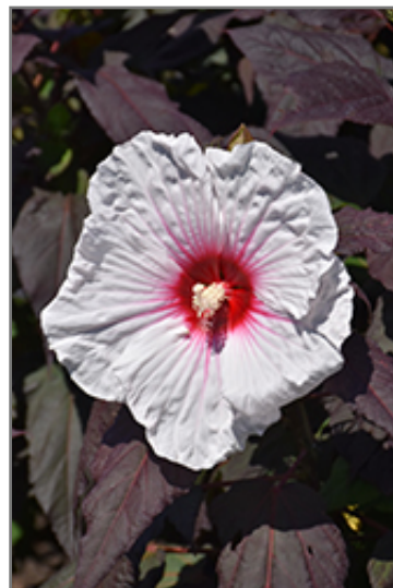
Dark Mystery Hibiscus flowers