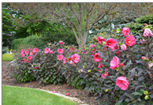
Summerific Evening Rose Hibiscus in bloom