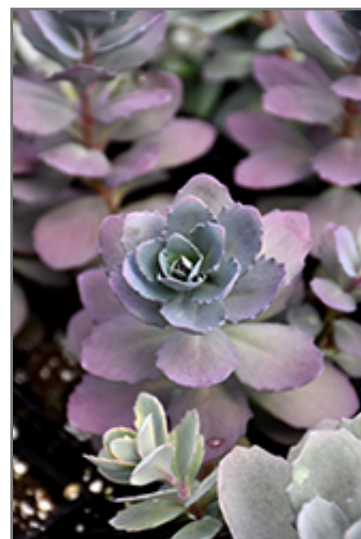
Plum Dazzled Stonecrop foliage