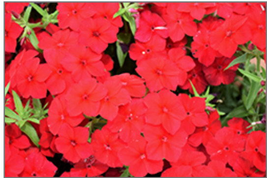
Phloxstar Red Annual Phlox flowers