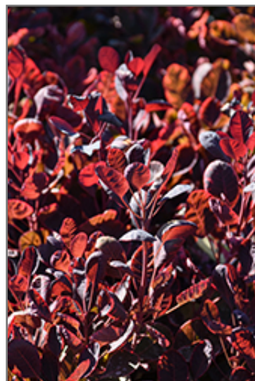
Velveteeny Purple Smokebush foliage

Velveteeny Purple Smokebush makes a fine choice for the outdoor landscape, but it is also well-suited for use in outdoor pots and containers. With its upright habit of growth, it is best suited for use as a 'thriller' in the 'spiller-thriller-filler' container combination; plant it near the center of the pot, surrounded by smaller plants and those that spill over the edges. It is even sizeable enough that it can be grown alone in a suitable container. Note that when grown in a container, it may not perform exactly as indicated on the tag - this is to be expected. Also note that when growing plants in outdoor containers and baskets, they may require more frequent waterings than they would in the yard or garden. Be aware that in our climate, most plants cannot be expected to survive the winter if left in containers outdoors, and this plant is no exception. Contact our experts for more information on how to protect it over the winter months.