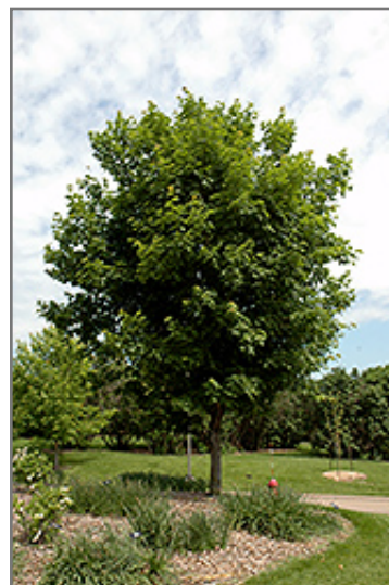
Sugar Maple

This tree should only be grown in full sunlight. It prefers to grow in average to moist conditions, and shouldn't be allowed to dry out. It is not particular as to soil pH, but grows best in rich soils. It is somewhat tolerant of urban pollution. This species is native to parts of North America.