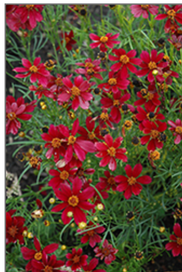
Red Satin Tickseed flowers